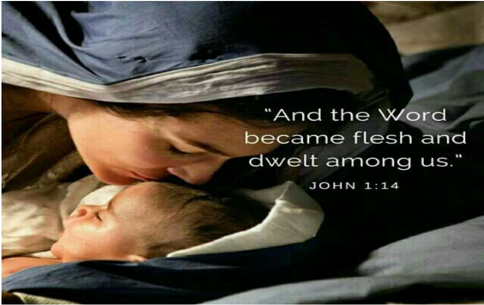
Jesus as a baby to a young boy then to a man