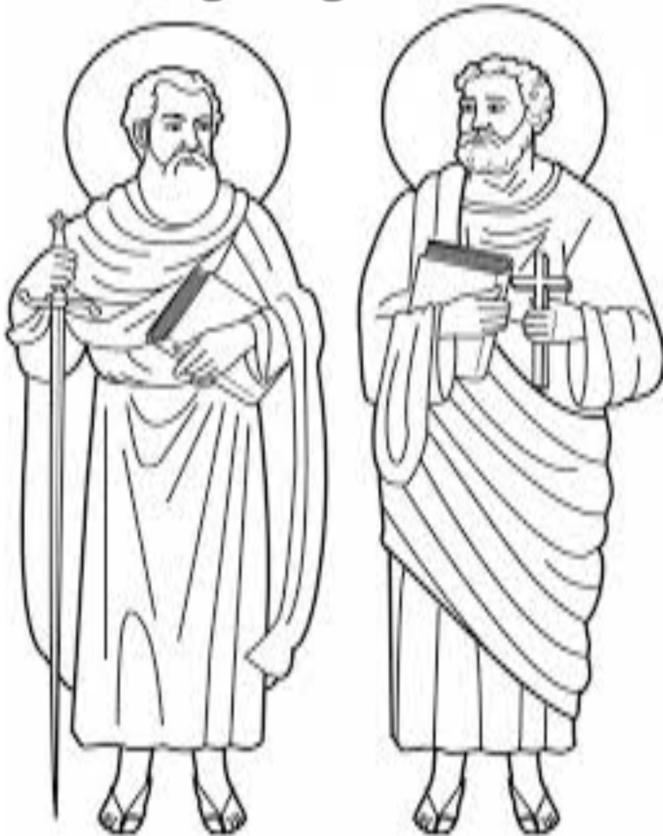
St Peter and St Paul